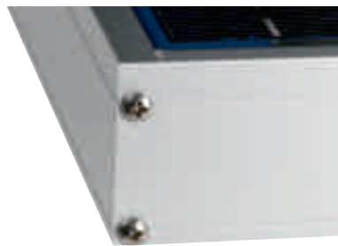
Clear-Anodized Universal Frame

See our website or your local representative for full terms of these warranties.