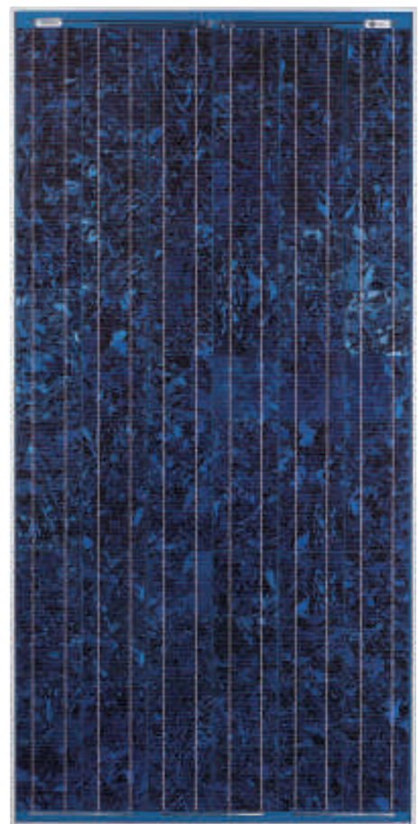
BP SX 150S